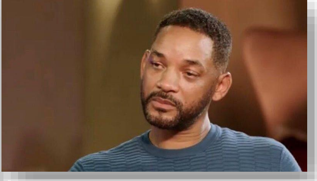
2020 every second