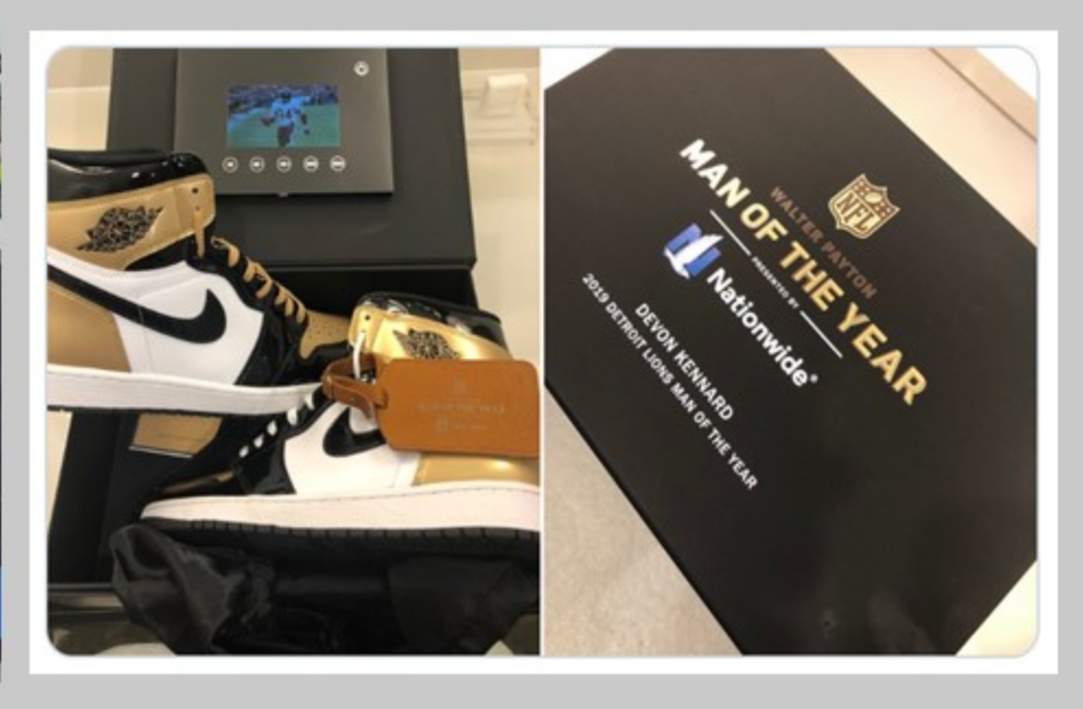
Red Carpet Clip

The combination of rich content and influential athletes resulted in a 700% increase in video views on Nationwide's O&O channels