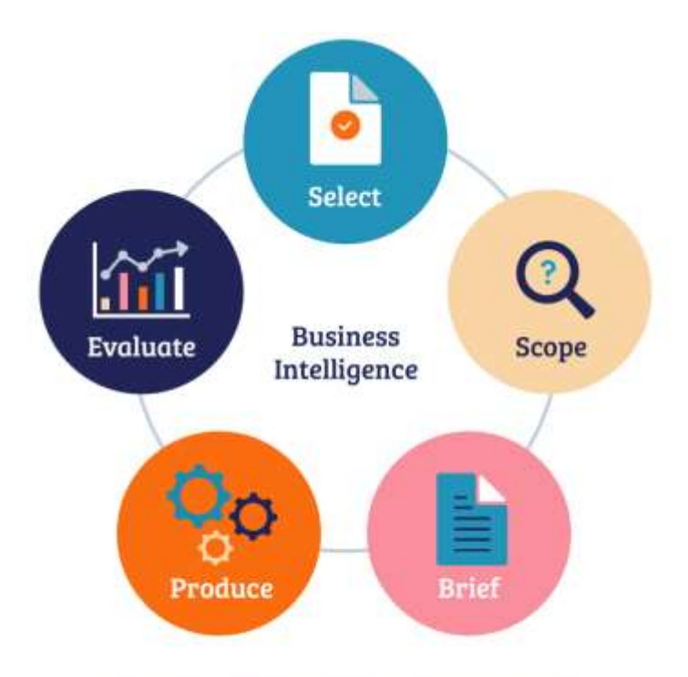
The Decideware Agency Lifecycle Platform